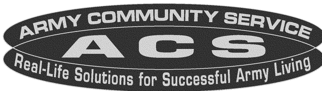
Figure 3–1. Army Community Service emblem

b. Identification signs will be prominently displayed on main roads on the installation to help newly assigned Soldiers, civilian employees and their families locate the center.